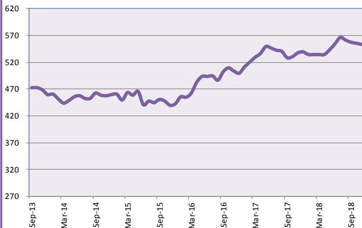
Total LAC numbers